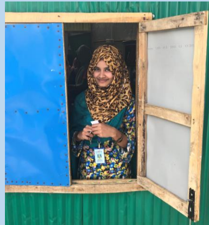
Midwife Hope Foundation Field Hospital taking a break from prenatal clinic Cox Bazar, Bangladesh (reproduced with permission)

One of the challenges is to convince women to come to the hospital or birthing center for their deliveries. The majority of women will deliver at "home" in the camps. Many women will only be brought to the hospital after laboring for days leading to fetal demise and significant maternal complications.