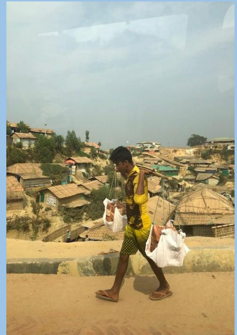
Rohingya man in Cox Bazar, Bangladesh (reproduced with permission)

A recently released white paper , provides a comprehensive review and assessment of current, published evidence for a single-dose HPV vaccination schedule. The white paper was compiled by researchers in the Single-Dose HPV Vaccine Evaluation Consortium , which encompasses nine leading independent research institutions partnering to collate and synthesize existing evidence and evaluate new data on the potential for single-dose HPV vaccination.